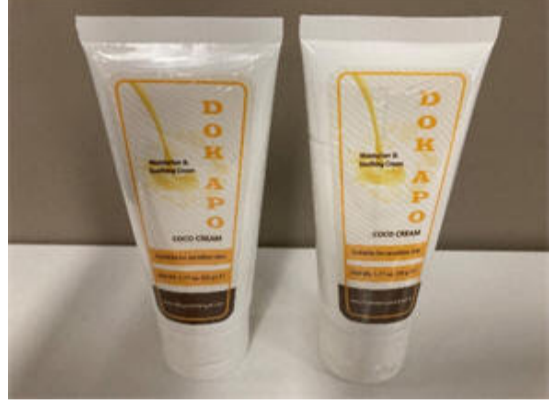
Images of NaturaCoCo Moisturising Cream (left) and Dok Apo Moisturiser Soothing Cream (right)

This month Medsafe have reported that these creams made in the Philippines have been found to contain the steroid flucinonide: