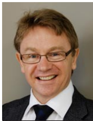
Children's Commissioner Dr Russell Wills

Each of these actions needs measurable objectives, a plan and resources of people and funds.